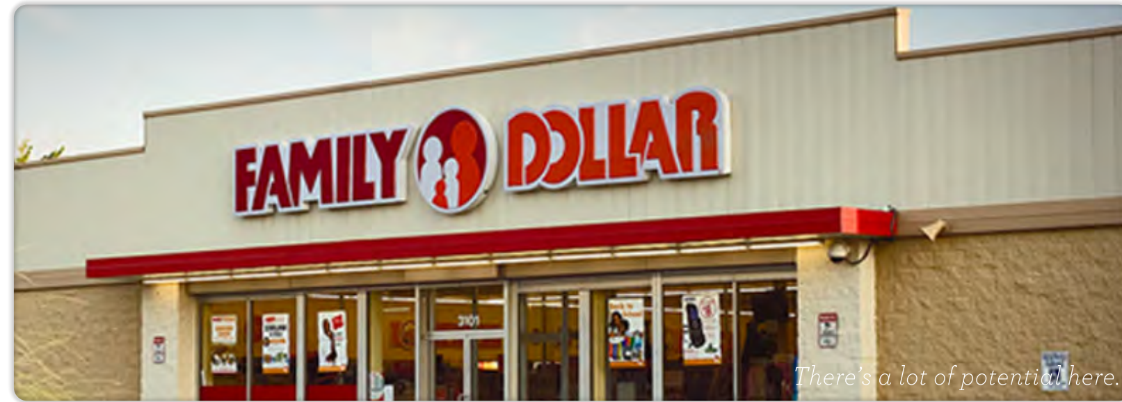
There's a lot of potential here.